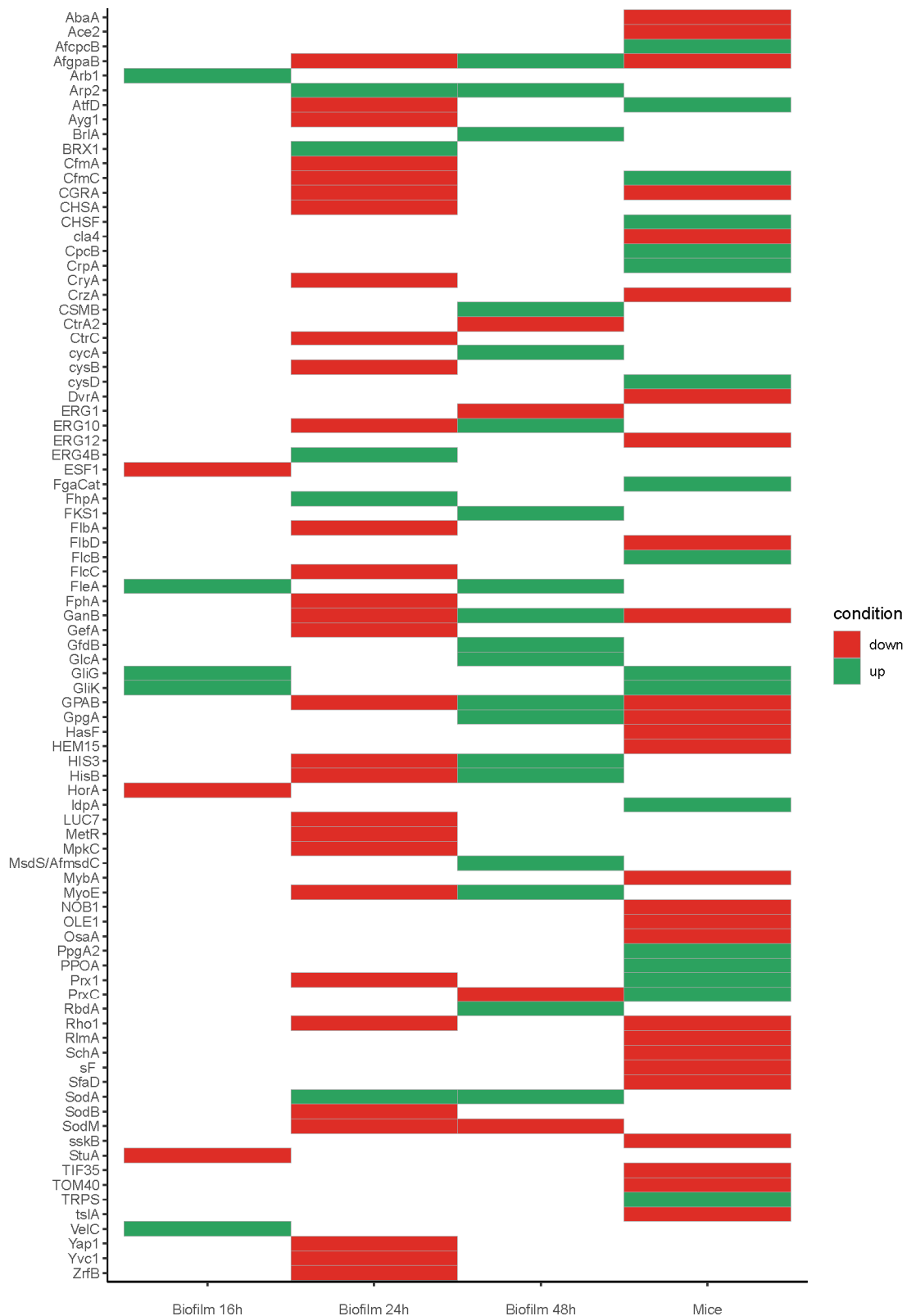
Figure 2. Heatmap showing the expression profiles of selected genes that are known to be involved in pathogenesis as reported by PHI database [111], expression and thresholds for differential expression was kept as reported by the authors, for mice and biofilm data, some conditions were grouped into one condition were: Mice up = Early up + late up. Mice down = Early down + late down. Biofilm 16 up = Biofilm unique (only expressed in Biofilm) 2-fold up in Biofilm. Biofilm 16 down = 2-fold down in Biofilm (Table 2). Full expression values are on Supplementary Material Table S1.