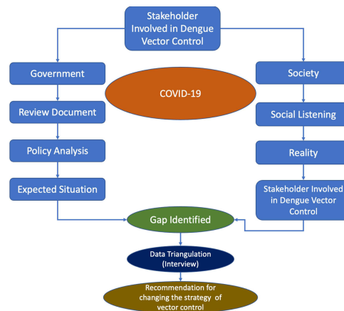
Figure 2 The developed framework used during the research.

center and health office, who was responsible for vector control in society and bridged communication to the health office related to proper dengue intervention in a particular area.