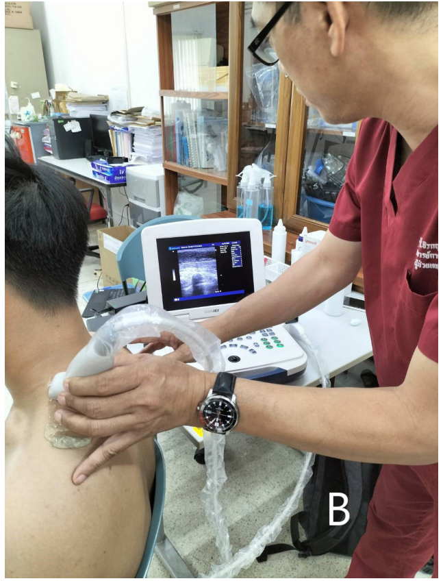
FIGURE 2. Ultrasound device (A) and Ultrasonography of upper trapezius muscle (B).

Correlation Coefficient (ICC) with a two-way random-effects model. Independent t test and repeated measurement ANOVA between group, intervention, and time were used. Finally, the effect size (Cohen's d) and power value of the result between the group was analyzed by a G*Power 3.1 (Germany; https://www.psychologie.hhu. de/arbeitsgruppen/allgemeine-psychologie-und-arbeitspsychologie/gpower) to confirm the clinical significant result with