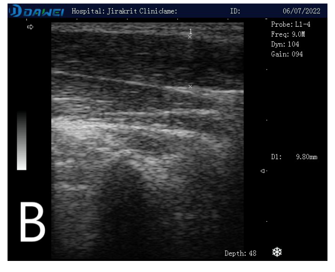
FIGURE 3. Ultrasonography image at 9 MHz, for measurement of upper trapezius muscle thickness before (A) and after completing the first intervention with Tok Sen (B). The vertical distance between two echogenic fascial layers was marked for measurement of upper trapezius thickness. D1 in both figures is a thickness of the upper trapezius muscle that was calculated by ultrasound imaging.