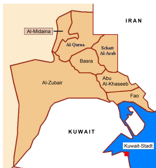
Fig. 1. Districts of Basra Governorate.

Statistical analysis. A package for Social Sciences (SPSS) Version 22 software was used for statistical analysis. The variables of the categorized groups, including age, sex, smoking, cavity, patients' type, and region for new and retreated TB cases, were calculated as total and proportions, respectively. Also, odds ratios (OD) and 95% CIs were calculated to compare newly diagnosed and retreated susceptible and DR-MTB cases. Drug susceptibility profiles of primary DR-MTB and acquired DR-MTB isolates were investigated using a Pearson chi-