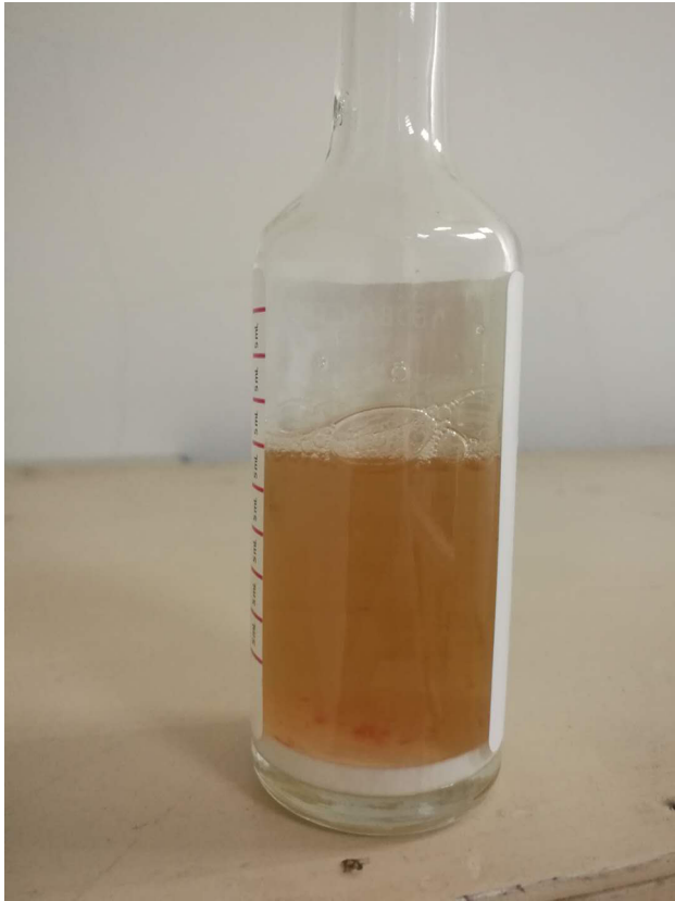
Figure S1 The liquid obtained from the aspiration was inoculated into the bottles of the Bactec for bacterial, fungal and mycobacterial culture.