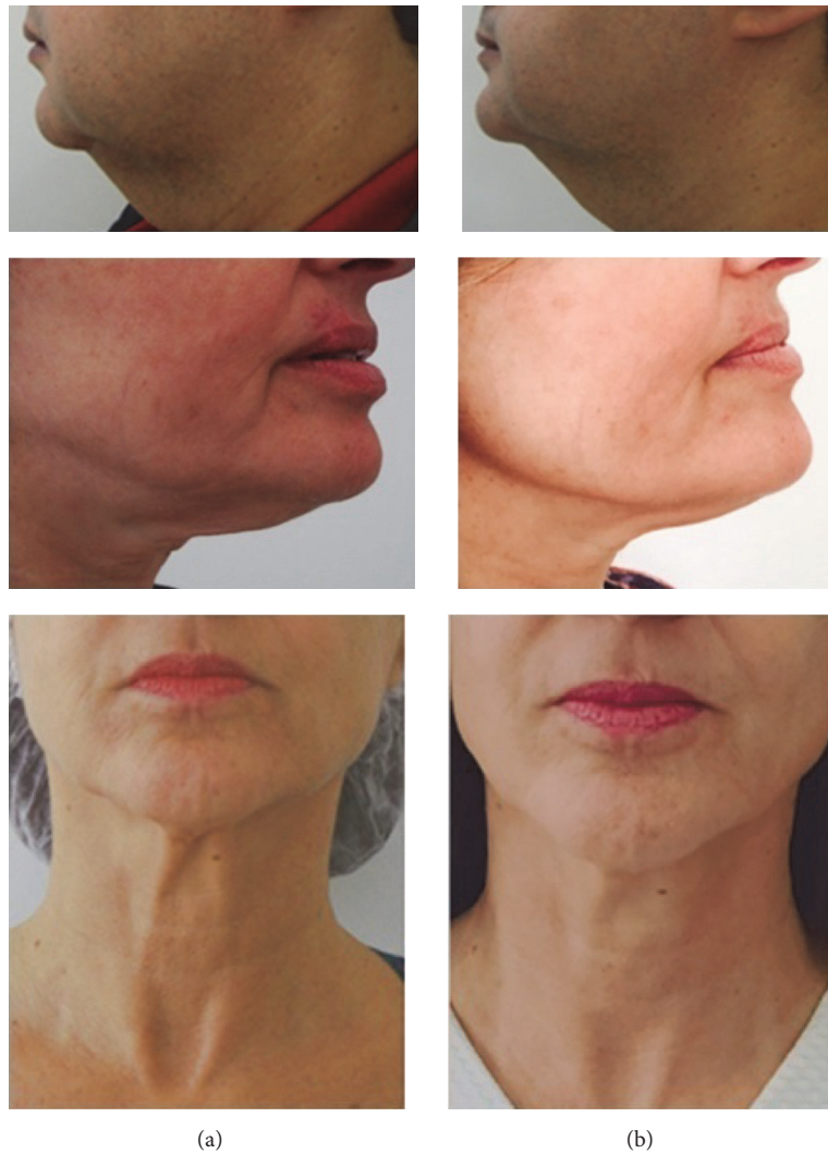
FIGURE 3: Improvements in skin condition. Photographs of selected patients before (a) and after eight sessions (b) of treatment with RF and PEMFs.

improvement in facial contour (25%) [10]. These variations could be explained by differences in ethnicities and ages of the treated patients, as Asian skin tends to age differently, with delayed wrinkle formation, compared to Caucasian skin. Younger patients also have less changes in skin overall appearance than older ones, and so the changes are less evident and harder to be noticed. In another study, thirty-one subjects with facial wrinkles and rhytides were treated with a similar device, and a significant decrease in Fitzpatrick Wrinkle and Elastosis Scale (FWES) was demonstrated [11]. A study demonstrated that RF and PEMF can also be effective for body treatment, in areas such as abdomen, flanks, arms, and legs [12]. The authors showed a significant reduction in visibility and in width and length of striae (stretch marks) in female patients.