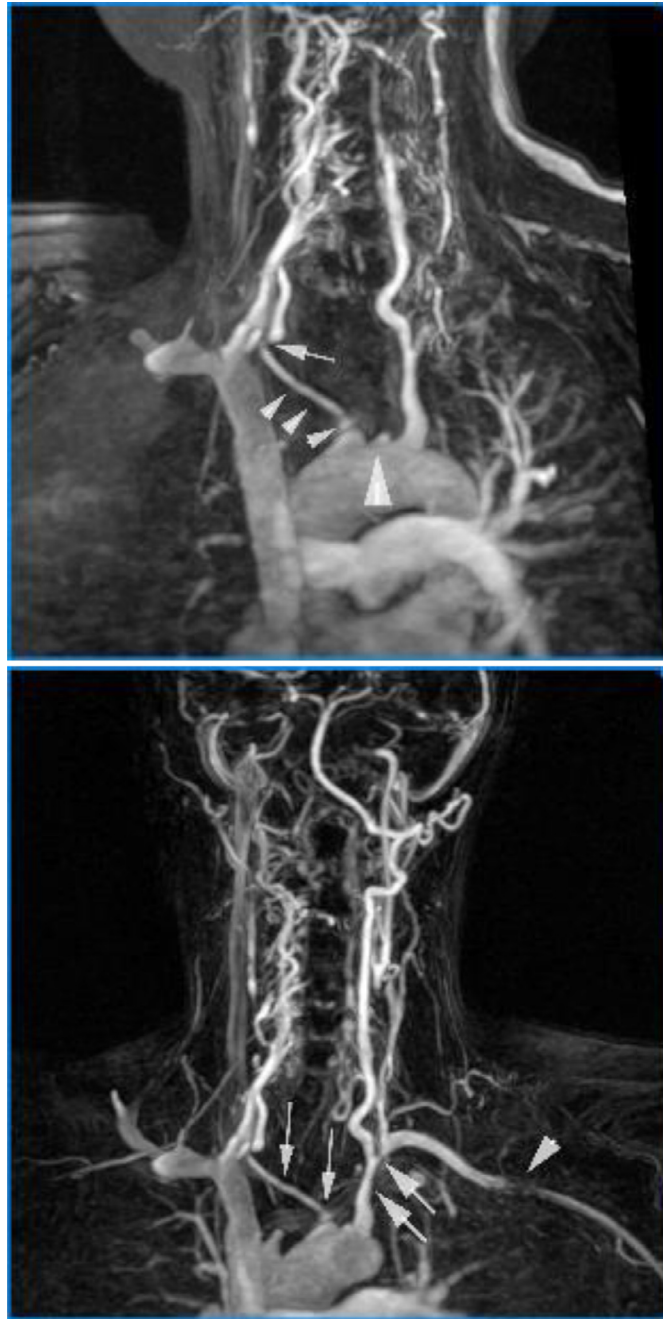
Fig. 2 – Neck MRA stump of the completely occluded left common carotid artery is noted, as it exits from aortic arch (large arrowhead). In addition, diffuse narrowing of the brachiocephalic trunk that continues with the right subclavian artery, without giving off the totally occluded right common carotid artery is noted (small arrowheads). Proximally, the brachiocephalic trunk is stenotic. Ostium of the right vertebral artery is also stenotic (arrow).

cervical and intracranial branches (Fig. 1). Hence, it was concluded that the dominant left vertebral artery was responsible for most of the basilar artery flow supply. The left vertebral artery contrast filling was altogether normal, including a normal ostium, normal cervical and intracranial segments, with a slightly enlarged diameter up to 5-6 mm. This likely represents a compensatory hypertrophy, since the left vertebral artery may potentially be the main blood supplier to the