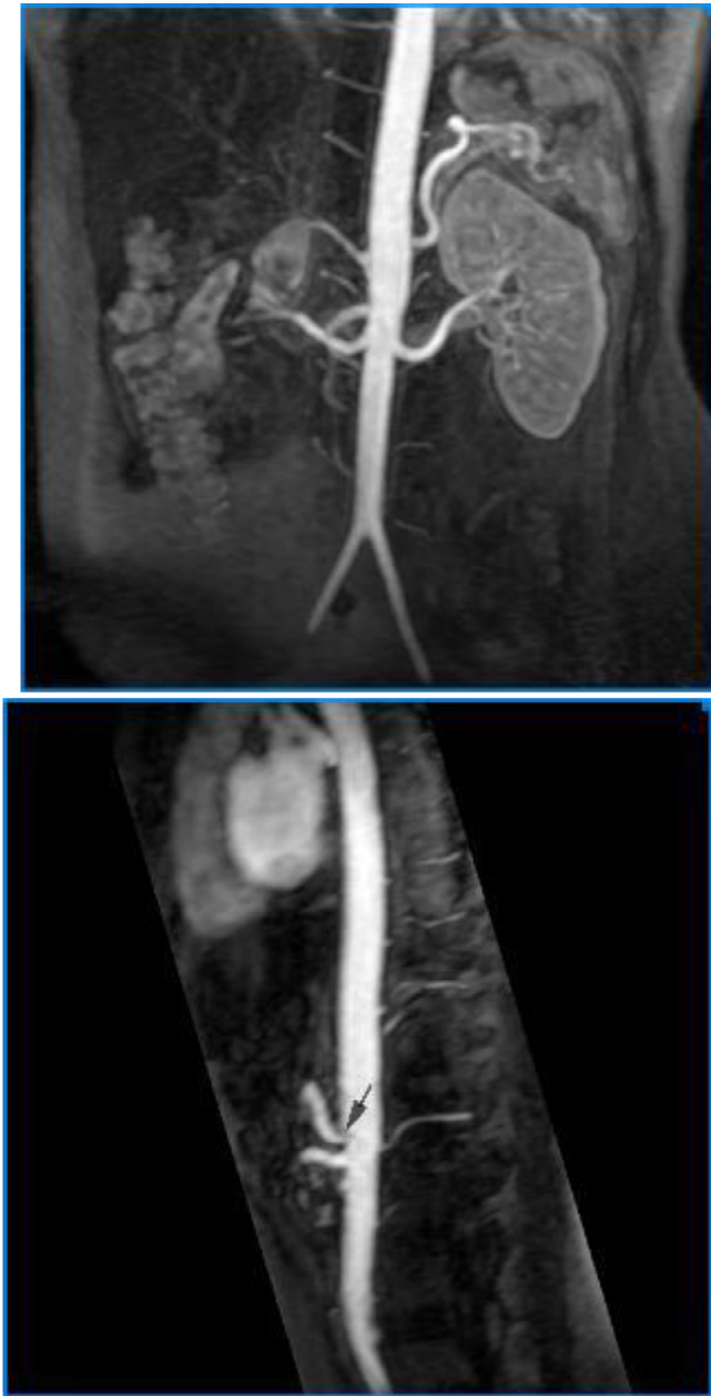
Fig. 3 – Angio MRI of abdominal aorta and renal arteries don't seem to be affected much, except for a mild narrowing at the origin of the celiac artery (black arrow).

imal left subclavian artery, up to the origin of the left vertebral artery was noticeable, in addition to a focal stenosis of approximately 80%, immediately adjacent to the origin of the left vertebral artery (Fig 1 and Fig. 3). A 50%-90% segmental stenosis of the left subclavian artery about 5 cm distal to its origin was also evident, however, the precise severity of the occlusion could not be correctly identified due to a number of artifacts (Fig. 1 and Fig. 3).