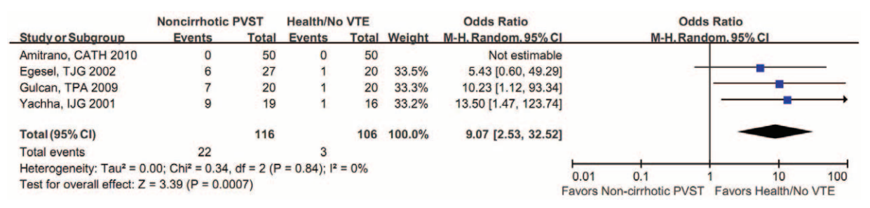
FIGURE 2. Forest plot comparing the proportion of positive IgG aCL between noncirrhotic patients with PVST and healthy controls without venous thromboembolism. aCL = anticardiolipin antibody, Cl = confidence interval, Ig = immunoglobulin, PVST = portal vein system thrombosis, VTE = venous thromboembolism.