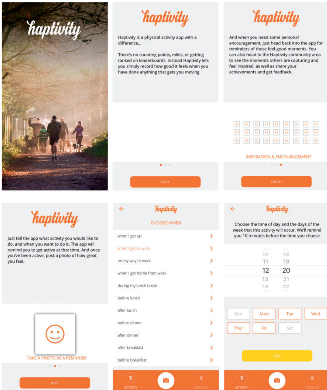
Fig. 2: Images of the app and its functionality.

facilitate future motivation. The encouragement element of the app did create PA motivation for some users, ‘It’s the same as if you were running a race. If people who are supporting you along the way, if you think to yourself, “I’ll give up,” but then somebody’s going to you, “Come on! No, you can do it!” it pushes you’. The ‘activity reminder’ function of the app was also well