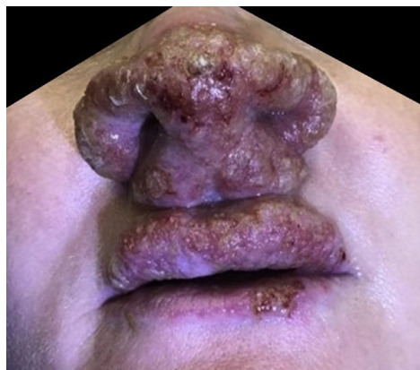
Fig 1. This 48-year-old woman presented with a 2-week history of painless red plaques with granulation tissue, pustules, and crusting of her swollen nasal tip and upper lip. She was diagnosed with impetiginized contact allergic dermatitis, facial cellulitis, and herpes simplex virus infection; however, 5 months after her initial presentation, she was diagnosed with PVeg.

She was diagnosed with impetiginized contact allergic dermatitis after self-treatment with neomycin, polymyxin, and bacitracin ointment for several weeks without improvement. She improved with prednisone 40 mg/d for 3 weeks but flared when it was stopped (Fig 1). The recurrence was so severe with swelling, crusting, and nasal obstruction that she was admitted to a community hospital with the diagnosis of facial cellulitis. She received intravenous doxycycline and clindamycin without improvement. A dermatologic consultation suggested a chronic herpes simplex virus infection, although molecular studies for herpes simplex virus I and II and varicella-zoster virus infection were negative. There was no benefit from courses of dapson, valacyclovir, or ciprofloxacin. Because of progressive exuberant inflammation, a second dermatopathologic opinion was obtained 5 months after the patient presented to dermatology, leading to a diagnosis of PV confirmed by serologic studies. She was treated with intravenous methylprednisolone 80 mg/d for 5 days, followed by prednisone 80 mg/d tapered with complete healing. The prednisone was tapered and she received 1 g rituximab-pvvr biosimilar infusion x 2, 2 weeks apart.