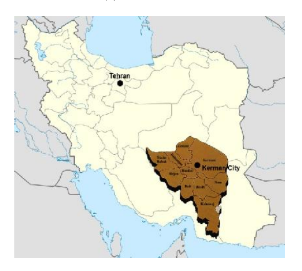
Fig.1: Kerman province and city

The lifestyle patterns are typically aggregated in families. In 2005, as part of the national survey on non-communicable risk-factors disease (NCDRFs) in Kerman province, 1614 inhabitants aged 15 to 64 years were recruited. The familial aggregation of NCDRFs such as physical inactivobesity, ity, high blood pressure, hyper cholestrolemia and high blood glucose with a risk ratio of 1.5 to 3.5 have been reported in a study published in 2007(2).