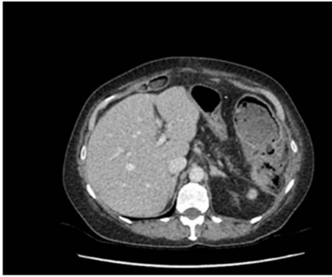
Figure 1: Significant inflammatory change surrounding an irregular appearing splenic flexure with the impression of a likely contained perforation in this region.

Within 14 hours postoperatively, she developed an erythematous patch on her left thigh, and a creatine kinase of 19 000. A bedside finger test was performed which showed dirty dishwasher fluid, necrotic fat and lack of bleeding. She was taken to theatre for urgent debridement for suspected NF. Antibiotics were changed to Meropenem, Vancomycin, Lincomycin and Fluconazole. She had extensive debridement of the soft tissue circumferentially on the left thigh, including some muscle. In 10 hours postdebridement, there was a radiological evidence of disease progression with gas in muscle compartments on the lower limb X-rays (Fig. 2a and b), and CT abdomen and lower limbs demonstrating gas throughout the whole left leg and a non-contiguous area in the right gluteal region (Fig. 3a and b). A diagnosis of multi-focal non-contiguous necrotising myositis was made.