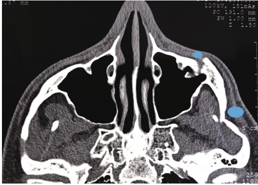
FIGURE 1: CT scan showing left displaced malar fracture. Blue dots point areas where HA was injected deep to the bone.