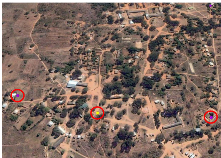
Figure 2 Homesteads mapped on satellite imagery. Images from June 2007 were obtained from DigitalEarth's QuickBird satellite at a resolution between 2.4 m – 10 m per pixel. Data points were geo-referenced with UTM zone 35S, WGS 1984. Three homesteads can be seen grouped around Mapanza clinic. This image is representative of those used in the analysis from Google Earth.