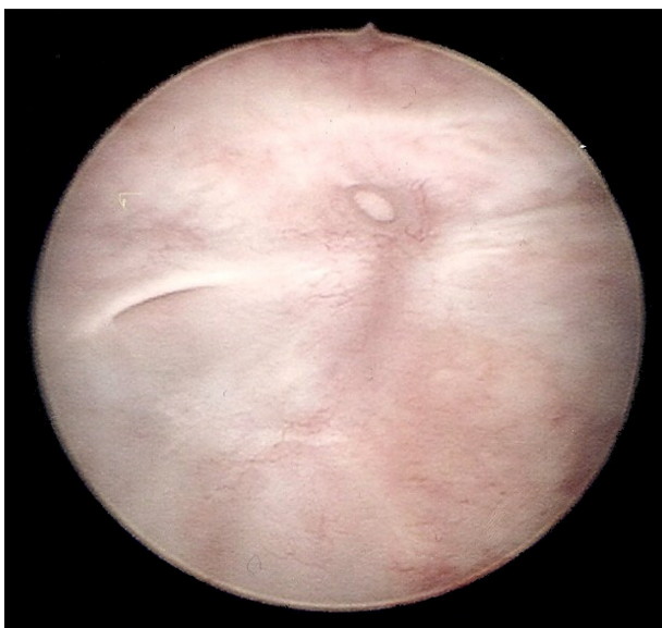
Figure 1 Cystoscopy image showing scarring around the right ureteric orifice and discrete fistula to centre of trigone.

The rate of successful fistula repair reported in the literature varies between 70% and 100% in nonradiated patients, with similar results when a vaginal or abdominal approach is performed, the mean success rates being 91% and 97%, respectively. Many institutions prefer to perform a urinary diversion. 1