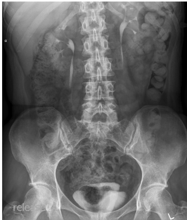
Figure 2 IVU showing normal upper tract with contrast in the urinary bladder and vagina simultaneously.

A classical transabdominal repair of the VVF was performed. The bladder was bivalved in the midline position, down to the level of the VVF. Both ureteric orifices were identified at the time of the procedure and were catheterized intraoperatively through the cystotomy incision (Figure 3).