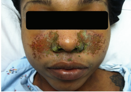
FIGURE 1: Case 1 demonstrates facial eczema herpeticum.