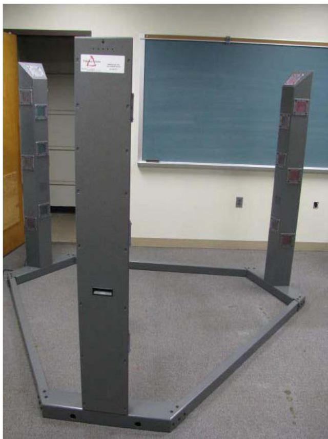
Figure 2 Makoto Testing Device.