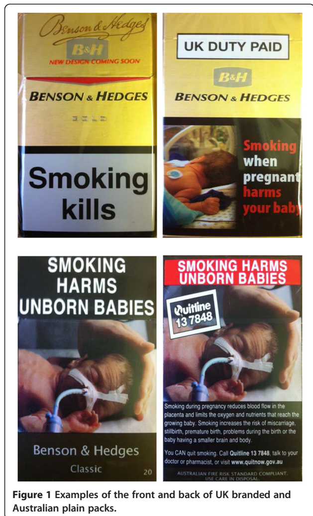
Figure 1 Examples of the front and back of UK branded and Australian plain packs.