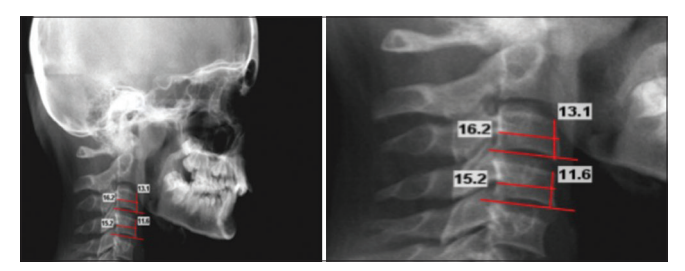
Figure 3: Radiographic analysis using Lateral Cephalogram in Female; AH3 = 13.1, AP3 = 16.2, AH4 = 11.6, AP4 = 15.2

OPG (10 males and 10 females) selected randomly from groups; these were traced and measured, and the same radiographs were measured again 10 days later.