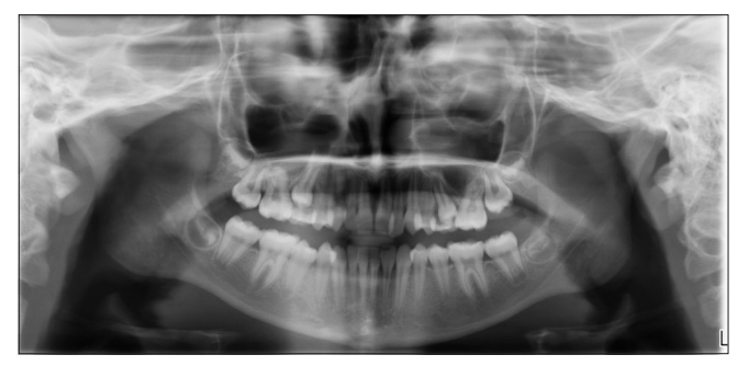
Figure 1: Radiographic analysis using orthopantomograph dental calcification stages (Demirjian 1973) 31 = H, 32 = H, 33 = G, 34 = G, 35 = G, 36 = H, 37 = G

Intraobserver error was calculated according to Dahlberg's formula using 20 cephalometric radiographs and 20