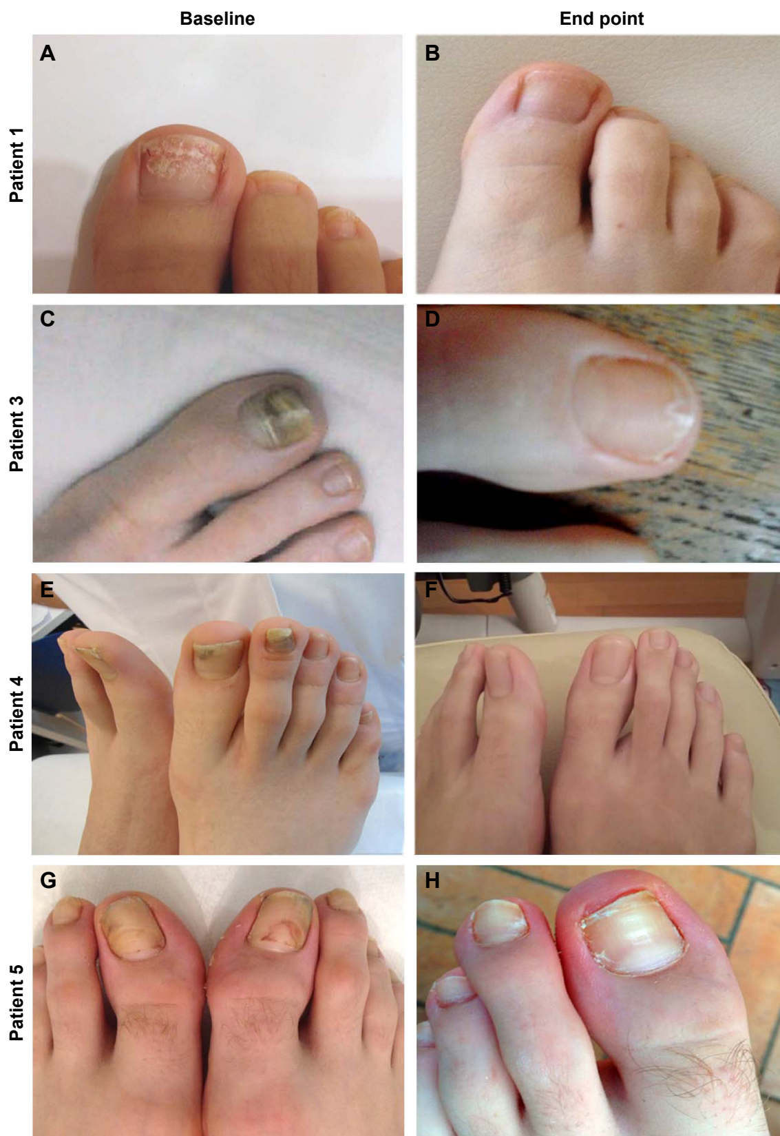
Figure 1 Representative clinical images of four patients at baseline and end point (12 weeks, topical tazarotene 0.1% gel therapy).

Notes: At baseline, patient 1 shows a nail involvement of 20%, patient 3 of 60%, patient 4 of 40% and 45% of two involved toenails, and patient 5 of 80%. At the end point, all patients appear clinically cured.