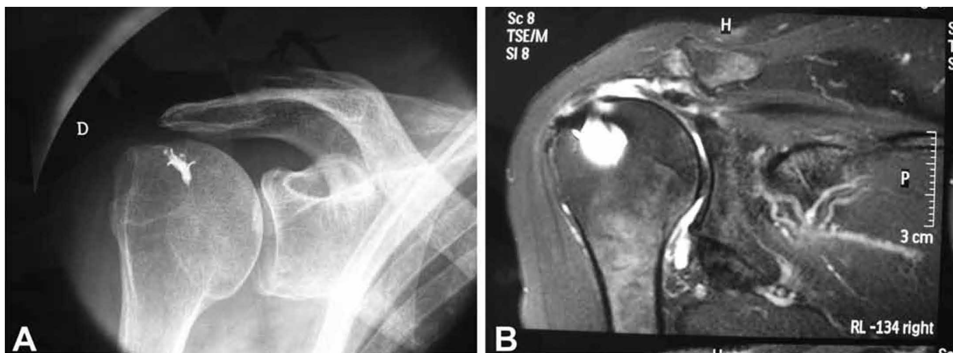
Figure 1 – Example of radiograph (A) and magnetic resonance image (B) of the right shoulder, showing tear in the tendon of the spinal supraspinatus muscle.

The mean time taken for the symptoms to restart was 21 months, with a range from zero to 228 months. Five patients who had undergone their first operation at