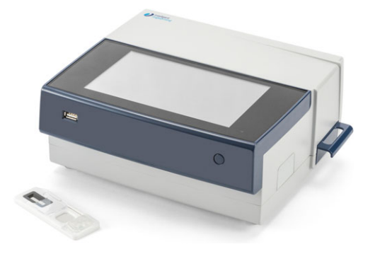
Figure 2. The Intelligent Fingerprinting Reader 1000 Unit and the Drug Screening Cartridge.

The process for analysis of the collected fingerprint sweat sample is as follows. The Drug Screening Cartridge activation buffer clip is depressed (see Figure 1)—this releases buffer solution into the sample collection cartridge. The sample collection cartridge is then inserted into the Reader 1000 analysis tray, as shown in Figure 2, and after following instructions, as directed by the Reader 1000 touch-screen, the results of the analysis of the test are displayed on the screen within 8 min of initiating the test. The result of each test gives a pass/fail for the presence of each drug, based on a cut-off for each analyte. For this study, the cut-offs for each drug detected using the lateral flow device were set at 190 pg for THC, 90 pg for BZE, 68 pg for morphine and 80 pg for amphetamine. The results obtained using the Drug Screening Cartridge and Reader 1000 can be printed to provide a permanent record.