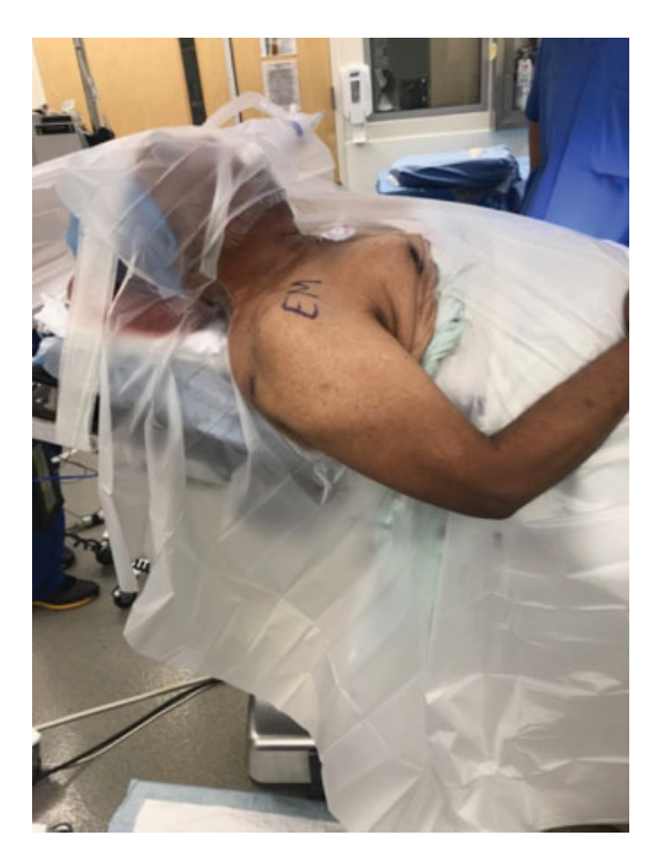
Fig. 4 Patient in the beach chair position in a less upright position (30 degree).

diluted in irrigation fluid during arthroscopic rotator cuff repair with the patient in the BC position reduces the incidence of hypotensive/bradycardic events and is as effective as epinephrine in maintaining the visual clarity of the surgical field.