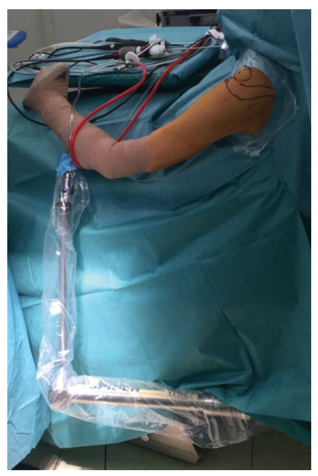
Fig. 3 Arm-positioner devices (e.g., Spider Limb Positioner, Smith and Nephew, Andover, Massachusetts, United States) may be either used for the lateral decubitus or beach chair position.

In the LD position, especially if reverse Trendelenburg position is used, blood may pool in the dependent lower extremities, causing reduced venous return to the central circulation followed by hypotension. However, hypotensive anesthesia during orthopedic procedures has been shown to be a safe and effective anesthetic technique for reducing operative blood losses and helping to maintain a clear surgical field. Morrison et al indicated that a safe and clear operative field can be achieved by a pressure difference of 49 mm Hg between the systolic blood pressure and the pressure measured within the subacromial space. Options to achieve such a difference can be increasing the arthroscopic pump pressure or hypotensive anesthesia, or a combination of both. Because excessive pump pressures can lead to complications related to fluid extravasa-