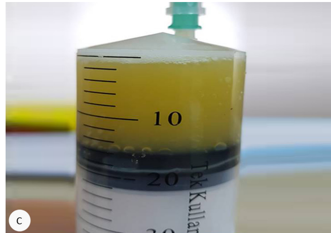
Figure 1. A) Transthoracic echocardiography (parasternal long-axis view), showing fibrinous pericardial effusion (arrows indicate the fibrin). B) Transthoracic echocardiography (parasternal short-axis view), showing the fibrinous pericardial effusion (arrows indicate the fibrin). C) Macroscopic imaging of the purulent pericardial fluid