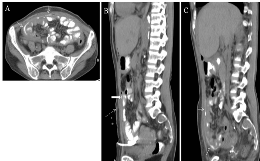
Figure 3 A, B and C. Peated CT scan when pus was completely drained and patient ingested 400 ml of Ultravist® medium. The transverse image suggested a cocoon-like conformation which kept the leaking medium from entering the peritoneal cavity (arrow in Figure 3A and 3C). Figure 3B shows the favored site of perforation (solid arrow) near the original exit site of PD catheter (dotted arrow). It was later proved by the laparotomy finding.

diagnosis of Pseudomonas peritonitis for better outcomes [9]. Our patient, in her second peritonitis event, was successfully treated with antibiotics for one month and continued her PD treatment. However, PD inadequacy soon became evident and this was also proved by follow-up peritoneum equilibration test. Her Kt/V decreased from 1.99 to 1.44, and weekly creatinine clearance dropped from 56 liters per week to 41 liters per week. These findings and severe edema persuaded her to switch to HD.