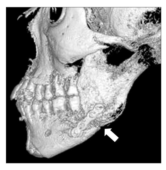
Fig. 5. Post-operative three-dimension computed tomography image of left mandibular angle area in 4 weeks after botulinum toxin type A injection. The gap between fragments was healed (arrow) and the occlusion was stable.

Hyun Seok et al: Correction of post-traumatic anterior open bite by injection of botulinum toxin type A into the anterior belly of the digastric muscle: case report. J Korean Assoc Oral Maxillofac Surg 2013