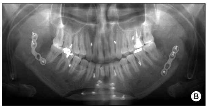
Fig. 2. First day after the third operation. A. Lateral view. B. Panoramic view. Hyun Seok et al: Yong-Tae Park et al: Correction of post-traumatic anterior open bite by injection of botulinum toxin type A into the anterior belly of the digastric muscle: case report. J Korean Assoc Oral Maxillofac Surg 2013