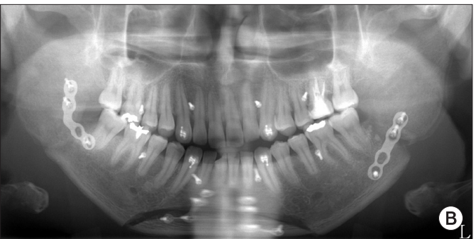
Fig. 4. Third day after botulinum toxin type A injection. A. Lateral view. B. Panoramic view.

Hyun Seok et al: Correction of post-traumatic anterior open bite by injection of botulinum toxin type A into the anterior belly of the digastric muscle: case report. J Korean Assoc Oral Maxillofac Surg 2013