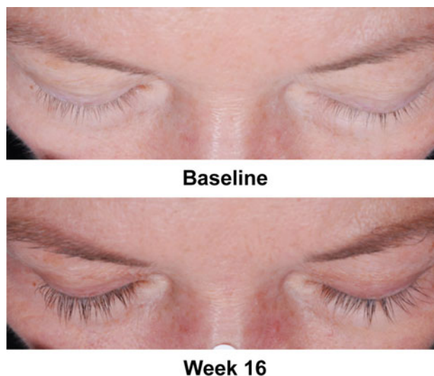
Fig. 2 Sample images of patient eyelashes before and after 16 weeks of once-daily bimatoprost treatment. The patient entered the study with a baseline overall eyelash prominence assessed as moderate (grade 2) on the Global Eyelash Assessment (GEA) scale. After 16 weeks of double-blind treatment with bimatoprost ophthalmic solution 0.03%, the patient's eyelashes were markedly prominent (i.e., GEA score of 3). In determining GEA scores, raters utilized a photonic guide and evaluated overall eyelash prominence, including length, fullness, and color of both upper eyelashes, with length considered the most important feature

was associated with significantly greater increases in overall eyelash prominence than vehicle as measured by at least a one-grade increase on the four-grade Global Eyelash Assessment (GEA) scale. These changes were sustained throughout the remainder of the treatment period (16 weeks) and, at week 16, 78.1% of subjects treated with bimatoprost exhibited at least a one-grade increase from baseline in GEA score compared with 18.4% of patients treated with vehicle ( P < 0.0001 ) (Fig. 2). Improvements in GEA scores continued to favor bimatoprost 4 weeks after discontinuation of treatment (i.e., the post-treatment visit at week 20). In the same study, efficacy was assessed by digital image analysis of superior-view eyelash photographs taken with standardized equipment and after uniform subject preparation at all visits. As assessed by such analysis, at week 16 bimatoprost treatment was associated with a mean 25% increase in eyelash length vs. 2% for vehicle, a mean 106% increase in eyelash thickness vs. 12% for vehicle, and a mean 18% increase in eyelash darkening vs. 3% for vehicle (Fig. 3). Subjects treated with bimatoprost for eyelash growth also reported feeling significantly more satisfied with their eyelashes, more confident in their looks, more attractive, more professional, and more satisfied with their daily routine than those subjects receiving vehicle as assessed by patient-reported outcome questionnaires.