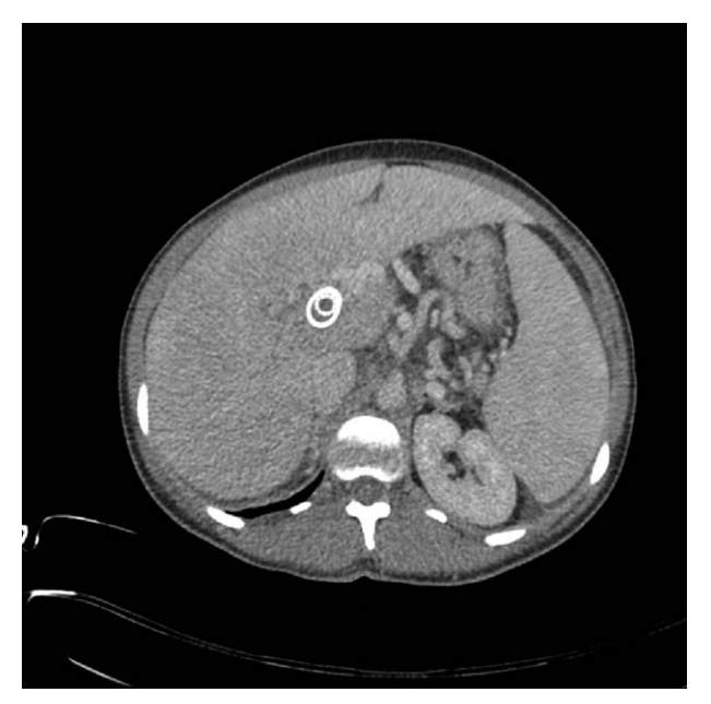
FIGURE 2. CT scan demonstrating stent in stent configuration and TIPS reocclusion. CT = computed tomography, TIPS = transjugular portosystemic shunt.

hepatomegaly, and ascites, the temporal dynamics, site, and extent of obstruction determine its clinical course.<sup>2,9,10</sup> Predisposing factors include, among others, inherited or acquired hypercoagulability and especially myeloproliferative diseases, as in our case.<sup>11</sup> Pregnancy itself is also a risk factor for BCS; however, usually additional risk factors are present.<sup>12</sup> With a 3year-lethality of 90%, untreated BCS has a dismal prognosis.<sup>8</sup> Due to the paucity of data, treatment is based on expert consensus and consists of anticoagulation, interventional angioplasty, or TIPS stent with the aim to decompress the portal venous compartment. If these treatments fail, LTX remains as the last resort.<sup>1,7,10,13</sup>