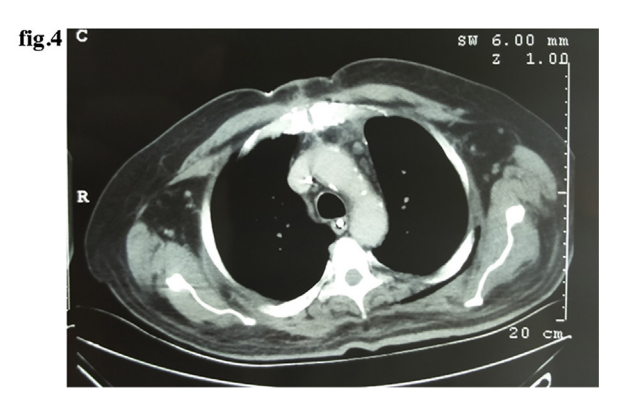
Figs. 3 and 4. Fluid level observed on chest CT with thickening of the anterior portion of the superior mediastinum.