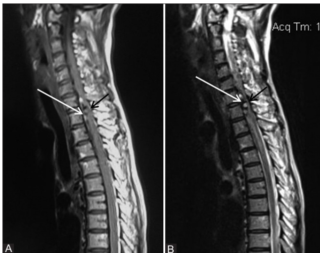
Figure 1 (A and B): MR images of the patient that were acquired at admission. Sagittal T1W (A) and T2W (B) images showing the multilobulated intraspinal extradural space-occupying lesion (white arrow) grossly compressing and displacing the spinal cord. The cord (black arrow) appears hyperintense on T2W images over a long segment suggesting edema (myelopathy). Note the flow voids (dark areas on both T1W and T2W) and areas of organized blood (bright areas on T1W) on the images, which raise a suspicion of abnormal vessels with small epidural hematoma