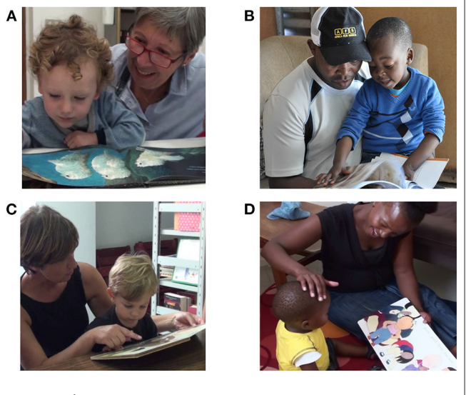
FIGURE 1 | Typical affectionate intersubjective behaviors in Dialogic Book-sharing, illustrated from the authors' training materials: (A) Following child gaze; (B) Following child pointing; (C) Pointing to focus of child interest and naming-elaborating; (D) Linking book-content to child experience and animating.

Given the benefits of DBS, a number of programmes for training carers in this method have been developed. A recent meta-analysis of 19 randomized controlled trials of DBS training, including in highly disadvantaged communities, reported a large effect on caregiver book-sharing quality (mean d = 1.01); and, regarding child outcomes, it showed benefits to both expressive and receptive language, across the age range (12–60 months) (mean d = 0.41 and 0.26, respectively) (Dowdall et al., 2020). There is also evidence for a benefit of training parents in DBS on infant focal attention (Cooper et al., 2014; Vally et al., 2015), an important component of general cognitive processing (Smith, 2013) and a key predictor of scholastic functioning (McClelland et al., 2013). Importantly, intervention studies have