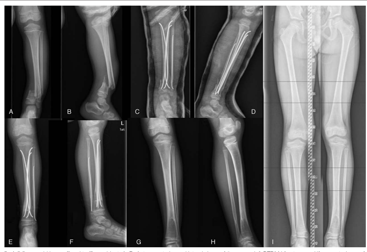
Figure 5. A 5.5-year-old boy suffered traffic accident. A, B, Anteroposterior and lateral views of the severe left DTDMJ fracture, multifragmented open fractures Gustilo type I. C, D, Immediate postoperative radiographs after closed reduction and fixation with ESINs, tibia was fixed with 3 nails, fibula with 1 nail. E, F, 5 months after surgery, the fracture showed radiographic evidence of healing. G–I, 36 months after surgery, no growth arrest or disturbances by radiological assessment, standing weight-bearing view showed 11 mm overgrowth on the left leg. DTDMJ = distal tibial diaphyseal metaphyseal junction, ESIN = elastic stable intramedullary nailing.

parts, proximal part and distal part. DTDMJ is the proximal part of the distal tibial metaphysis. All the 21 cases in this study were located at this junction, and satisfied results have been achieved. If the fracture is located at the distal part, which is more adjacent to the epiphyseal plate, in our opinion, it will be too difficult to fix the fracture and keep its stabilization by the nails unless the tips of the nails are perforated at the growth plate. The reason is that the fracture line is very close to the growth plate and nails are insufficient for keeping the reduction while the nails stop at the growth plate. Cravino et al<sup>[22]</sup> reported in some distal tibia