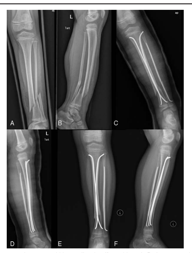
Figure 4. A 7.1-year-old boy suffered traffic accident. A, B, Anteroposterior and lateral radiographs of the left leg with mild oblique unstable DTDMJ fracture. C, D, Immediate postoperative radiographs after closed reduction and fixation with ESINs. E, F, 6 months after surgery, the fracture showed radiographic evidence of healing.

external fixation, plate, or percutaneous pinning have been proposed as possible management options.<sup>[9-14]</sup> Although reasonable success has been reported with various treatment