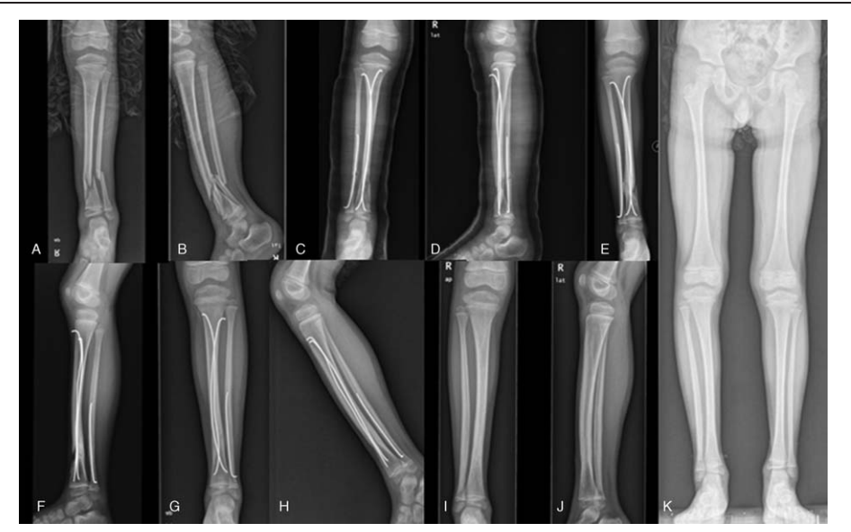
Figure 3. A 7.4-year-old boy suffered traffic accident. A, B, Anteroposterior and lateral views of the severe right oblique DTDMJ fracture, multifragmented open fracture, Gustilo type I. C, D, Tibia was fixed with 2 nails, fibula with 1 nail. E, F, 6 months after surgery, the fracture with radiographic evidence of delay union. G, H, 10 months after surgery, the fracture showed evidence of healing. I, J, 16 months after surgery, no growth arrest or disturbances by radiological assessment. K, 24 months after surgery, standing weight-bearing view showed 10 mm overgrowth on the right leg.

external fixation, plate, or percutaneous pinning have been proposed as possible management options.<sup>[9-14]</sup> Although reasonable success has been reported with various treatment