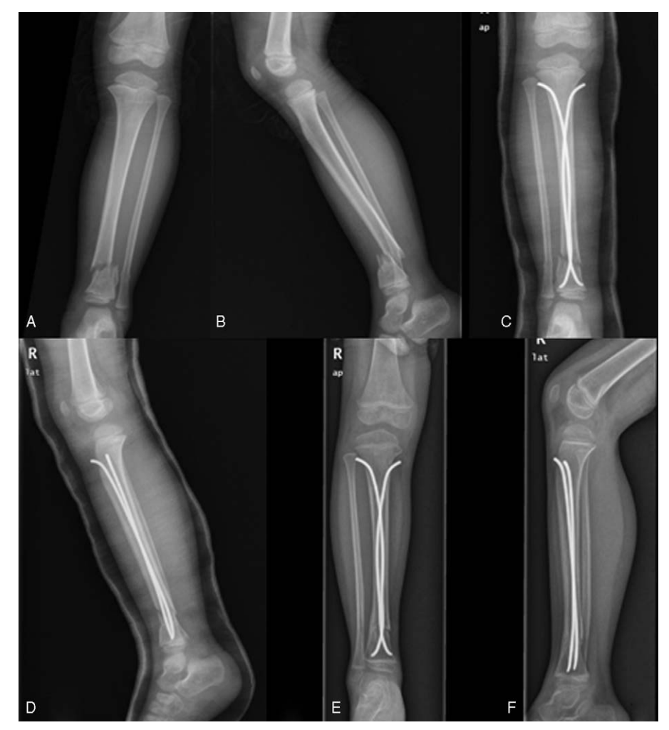
Figure 2. A 6.1-year-old girl fell down from 1.5 m height. A, B, Anteroposterior and lateral views of the severe right DTDMJ fracture, mild oblique type. C, D, Immediate postoperative radiographs after closed reduction and fixation with 2 nails. E, F, 3 months after surgery, the fracture showed radiographic evidence of healing. DTDMJ = distal tibial diaphyseal metaphyseal junction.

cases were associated with distal fibular fractures, from which 18 fibular fractures were completely displaced.