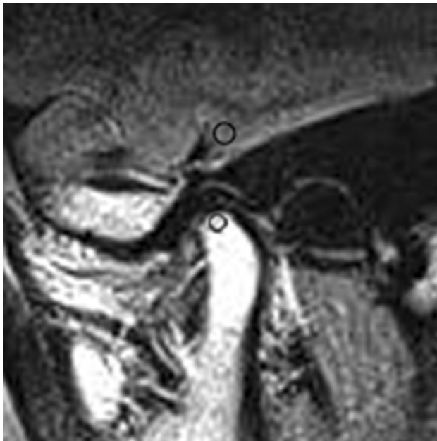
Fig. 1 Measurement of region of interest (ROI) on corrected sagittal FLAIR images in closed-mouth position. The lower circle represents a 4.5-mm 2 ROI in the bone marrow of the mandibular condyle; the upper circle represents a 5.9-mm 2 ROI in the gray matter. Both were placed as close as possible to the top of the condyle on a line running perpendicular through its length