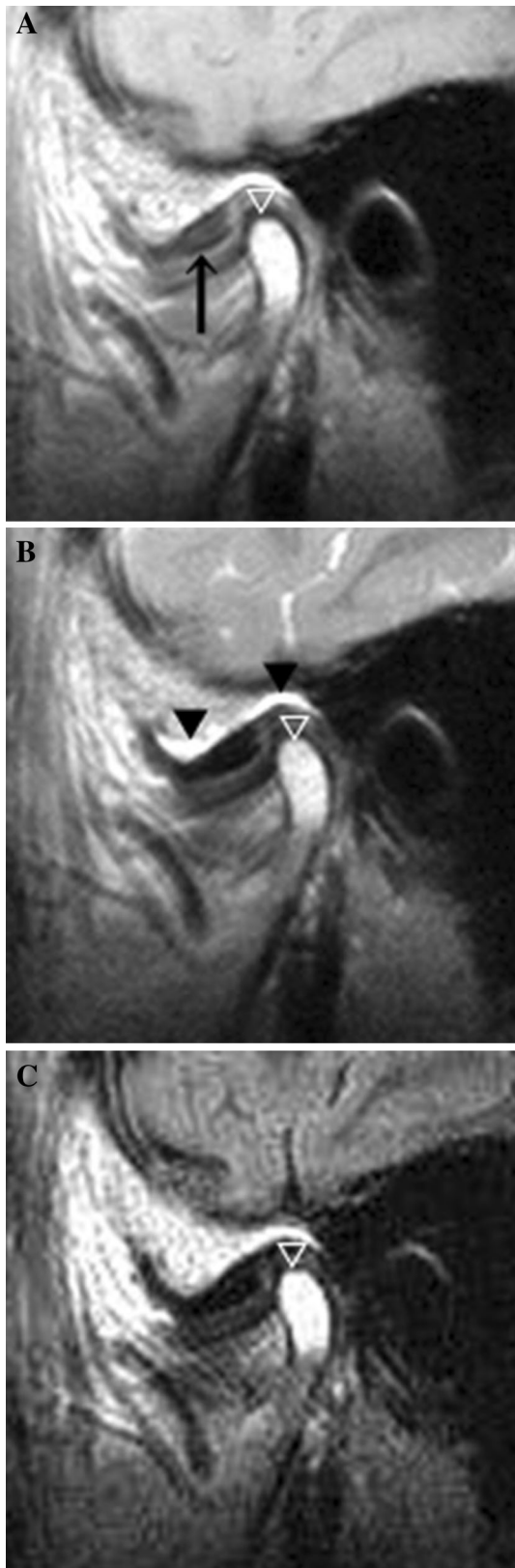
◀ Fig. 2 Painful TMJ with disk displacement and no reduction in a 68-year-old woman. A disk ( arrow ) was anteriorly displaced on a proton density-weighted image ( a ), and a large amount of joint effusion ( arrowhead ) was observed in the upper joint space on a T2-weighted image ( b ). The SIR was 1.90 for the bone marrow of the mandibular condyle on a FLAIR image ( c ). No bone marrow change was apparent on any MR images ( white arrow ) ( a–c )

osseous microcirculation with associated intramedullary stasis may lead to severe and prolonged ischemia that eventually results in bone necrosis [19]. Osteonecrosis seems to be preceded by bone marrow edema, showing that venous stasis may lead to increased intramedullary pressure and may assume a role in ischemic damage and subsequent necrosis [20, 21]. The establishment of ischemia induces a vicious cycle involving cellular edema, increased pressure, and metabolic imbalance leading to cellular necrosis [19, 22]. Therefore, it is thought that ischemia may precede bone marrow edema and osteonecrosis in the condyle.