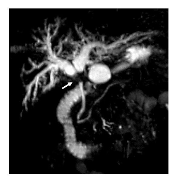
Fig. 2. Magnetic resonance cholangiopancreatography showed a stricture of the common hepatic duct (arrow) and dilatation of the bilateral intrahepatic ducts.