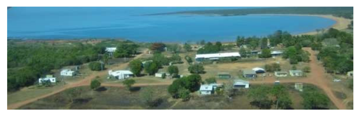
Figure 1. Yilpara viewed from the air.

The research described here took place with the Yolnu people in the north-eastern tip of Arnhem Land, Northern Territory. Settled in 1972, Yilpara is the largest homeland community in the region, but still a very small community of approximately 100 people (see Figure 1). As part of the 'homelands movement', the history of the Yilpara community is strongly linked to Aboriginal self-determination. The movement was an Aboriginal-initiated action demonstrating 'the desire of Aboriginal people to assert control over their lives' ([38], p. 343). The movement was also supported in that era by federal government self-determination policies, following the first land rights claims in the mid-1960s. Features of homeland communities include a desire to uphold traditional law and culture, a desire to escape from the dysfunction associated with living in more mainstream environments, and a rejection of government assimilationist policies. Through this movement Aboriginal leaders 'sought to reassert the management and ownership of their land' ([39], p. 114). The beneficial impact of homelands movement on health outcomes has been demonstrated, with lower-than-expected morbidity and mortality in a decentralised Aboriginal community [40].