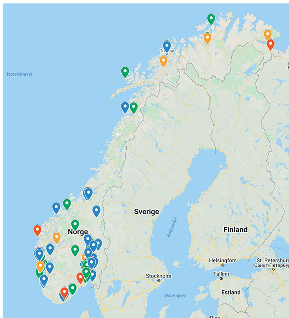
Figure 2. The 92 general practices recruited to PraksisNett. Green denotes 2–4 GPs per general practice, blue 5–7 GPs, yellow 8–10 GPs and red > 10 GPs (map from google.com/maps).

also compared to many international PBRNs, as PraksisNett will have the IT infrastructure necessary to plan studies, identify and invite patients and monitor routine and clinical data for studies in primary care. This is a novel and innovative part of PraksisNett but also the part that has demanded most resources and caused delays in the establishment of the infrastructure. Especially, the collaboration with many different EHR vendors, changes in EHR hosting from local servers to web-based servers and the introduction of GDPR have so far caused several time-consuming delays and adjustments during the establishment period.