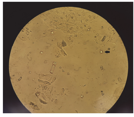
FIGURE 1: Urine sediment showing envelope-shaped calcium oxalate crystals (arrow).

The venous lactic acid level was initially attributed to a laboratory error given the consistently profound low pH on repeated arterial blood gases. A thorough investigation into the cause of this perceived severe lactic acidosis was undertaken and no clear etiology was identified. There was no evidence of sepsis or postictal symptoms, head CT was negative for stroke, and glucose and beta hydroxybutyrate were within normal limits. Furthermore, there were no signs of gangrenous tissue and surgical and radiological evaluations were negative for ischemic bowel or incarcerated