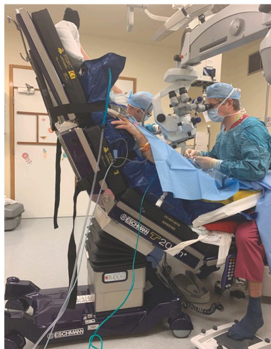
Fig. 2. Photograph depicting position of patient during surgery. The blue vacuum bean bag positioner can be seen underneath the patient. His feet are seen in the top left. (For interpretation of the references to colour in this figure legend, the reader is referred to the Web version of this article.)

K M Miller of UCLA (University of California, Los Angeles) has reported using pillows and tape to secure patients during cataract surgery, as have others, namely Gordon et al. (2005) and You et al. (2015). 11,12 We found that using a vacuum beanbag enabled easy, secure, and fast positioning for our patient. Similar bean bag positioners have been used