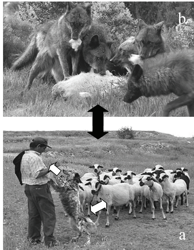
Figure 1. Epidemiology of Echinococcus granulosus in Spain. The main domestic cycle is maintained between dogs and sheep, with man as accidental intermediate host (a; white arrows). Wild cycles could occur between wolves, wild boars, and cervids, among others (b). The sylvatic cycle could be occasionally peridomestic (black arrow), since the G1 genotype, the most frequent in sheep and human patients, has been found in isolates from wild animals. doi:10.1371/journal.pntd.0000893.g001