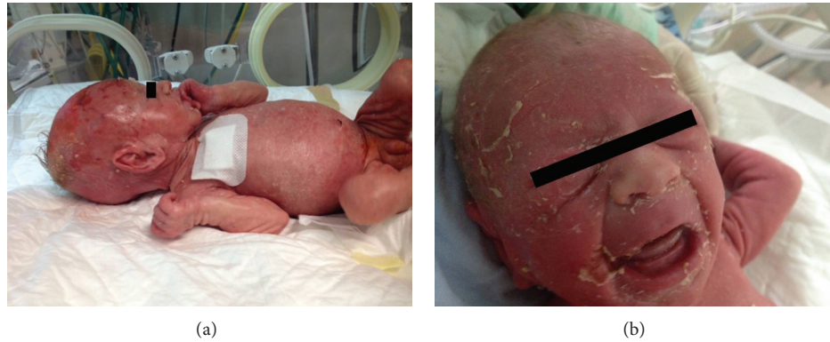
FIGURE 1: (a, b) Generalized exfoliation over the face, trunk, and limbs with excessive scalp scaling.

From his 2nd day of life (dol) the neonate presented severe hypernatremia (highest level of sodium at 180 mmol/L (3rd dol) (reference values: 128–150) and weight loss (max at 17% at 4th dol)) due to increased transepidermal water loss. Hypernatremia diagnostic work-up, combined with low potassium levels, normal renin activity value, and mild metabolic alkalosis, was compatible with hyperaldosteronism (aldosterone 392 ng/dL (reference values: 19–141) and renin 4920 ng/dL/hr (reference values: 1100–16700)). During hospitalization recurrent episodes of sepsis occurred due to Klebsiella pneumoniae , Candida parapsilosis , Staphylococcus haemolyticus at 9th, 12th, and 27th dol, respectively.