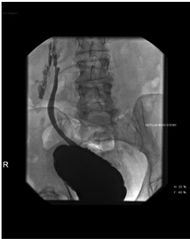
Figure 1. Fluoroscopic image obtained during video urodynamics confirming extravasation of contrast from the ureteropelvic junction.