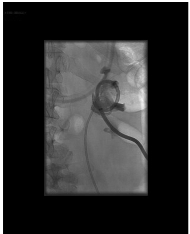
Figure 3. Fluoroscopic image obtained during antegrade pyelograms demonstrating a resolution of the injury, and no extravasation of contrast.