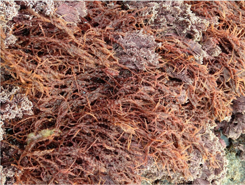
Figure 4. doi

Red macrophytes Asparagopsis armata and Ellisolandia elongata at lower intertidal level (by the Island Aquatic Ecology Subgroup of cE3c-ABG).