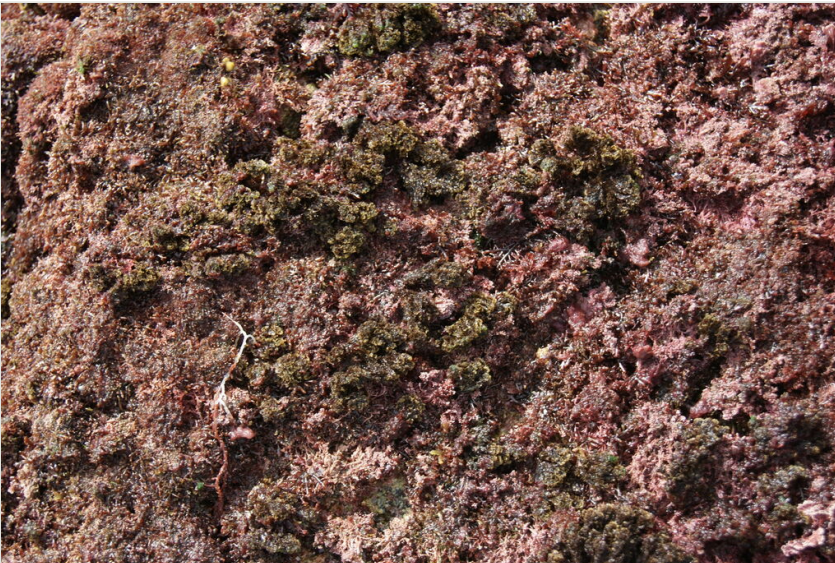
Figure 3. doi

The red macrophyte Gelidium microdon , a characteristic species of the Azorean high intertidal level (by the Island Aquatic Ecology Subgroup of cE3c-ABG).