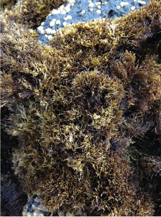
Figure 2. doi

The red macrophyte Gelidium microdon , a characteristic species of the Azorean high intertidal level (by the Island Aquatic Ecology Subgroup of cE3c-ABG).