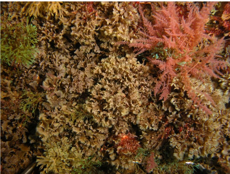
Figure 5. doi

Red macrophytes Asparagopsis armata and Ellisolandia elongata at lower intertidal level.