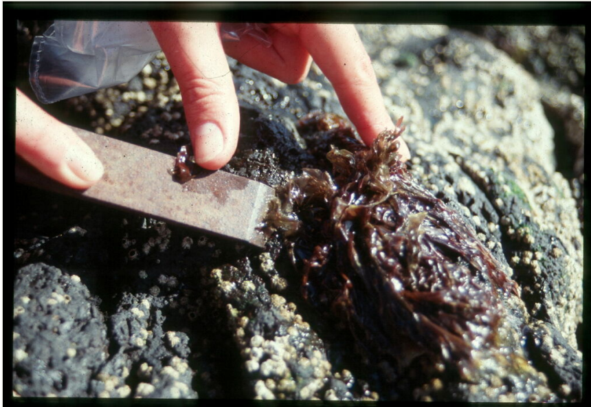
Figure 7. doi Collecting macroalgae at the rocky intertidal (by the Island Aquatic Ecology Subgroup of cE3c-ABG) .