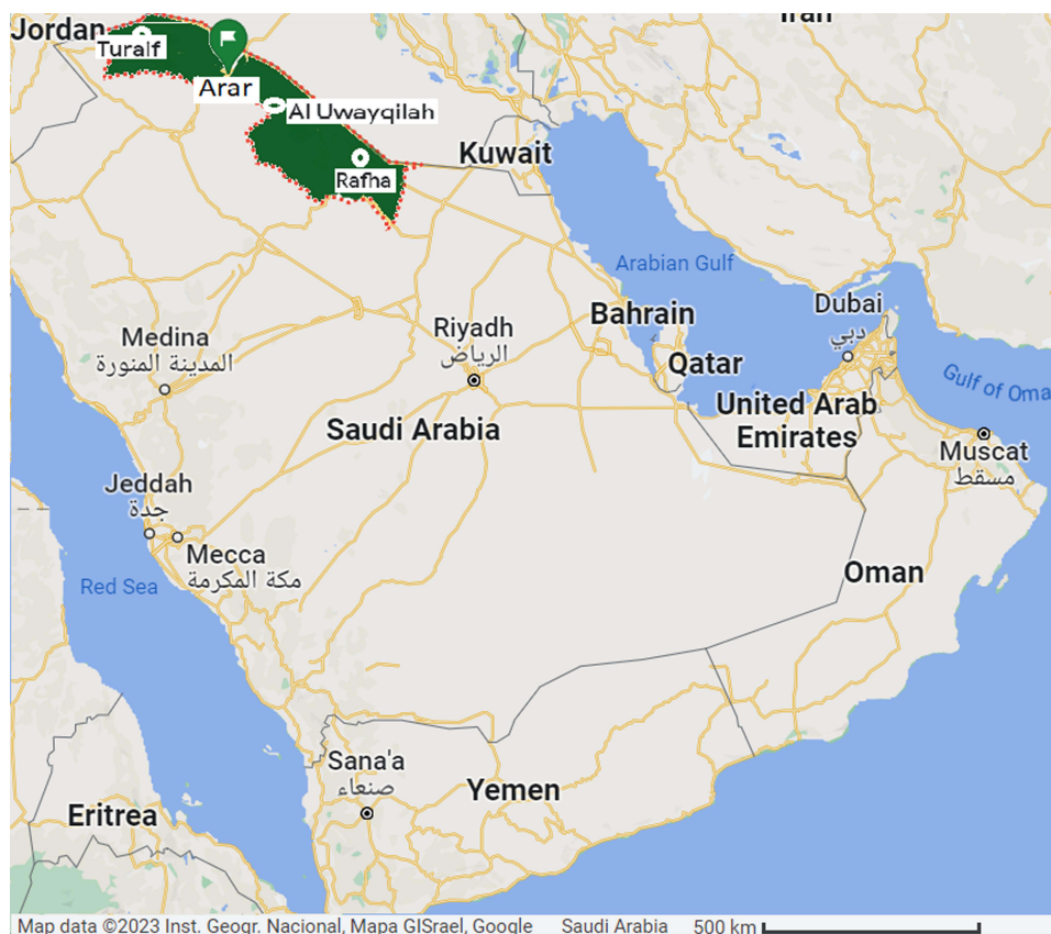
Figure 1 The geographical location of the Northern Border Province (green area) in Saudi Arabia. It includes four main areas, as indicated in the figure.