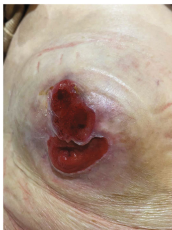
FIGURE 4: Right-sided parastomal hernia 2-month after discharge. Bile staining skin changes completely resolved. Superior peristomal skin ulceration.

the abdomen. Our main aim was to perform the cholecystectomy for rapid source control. The hernia defect was not repaired as this would have unnecessarily prolonged operative time in an acutely unstable patient with multiple comorbidities.