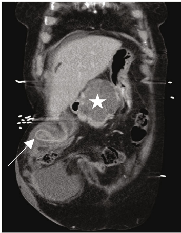
FIGURE 2: Computed tomography scan of gallbladder herniation (arrow) and large complex cystic head of pancreas lesion (star) in coronal plane.

On examination, her vital signs were within normal limits. A lower midline laparotomy scar was present. Her abdomen was distended with no skin changes, and the right parastomal hernia was incarcerated, measuring 20 by 20 cm, with focal tenderness.