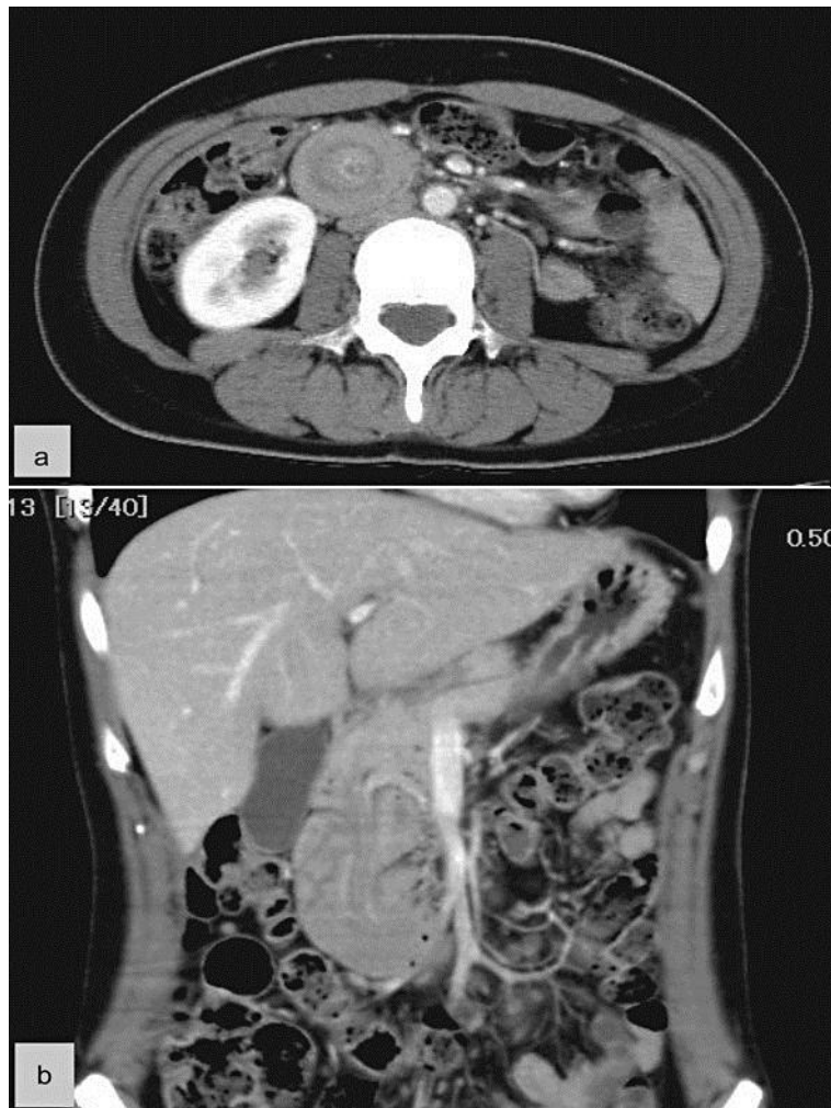
Fig. 2. Subsequent contrast-enhanced abdominal CT shows ‘target’ appearance in the region of the duodenum confirming the diagnosis of duodenoduodenal intussusception (a). Coronal multiplanar reformatted image shows duodenoduodenal intussusception (b).