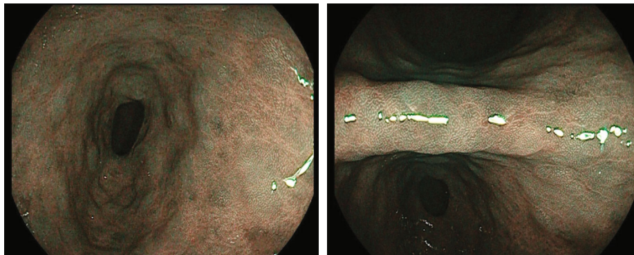
FIGURE 2: Detection results of the control group.