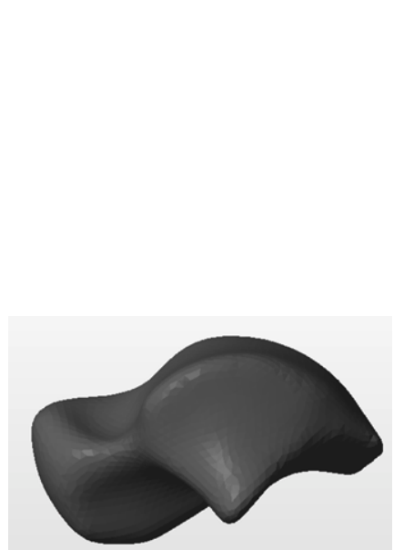
Figure 2. The image of expected talus processed by three-dimensional CT, CAD which is produced by measuring mirror image from the contralateral talus.