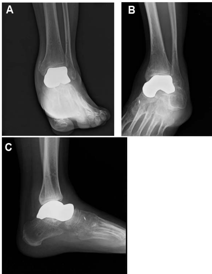
Figure 5. The postoperative radiographs showed the total talar prosthesis implant which was well seated in the ankle mortise, talocalcaneal, and talonavicular articulations, A) anteroposterior, B) mortise, and C) lateral radiographs.

The present study highlights the process of customizing and manufacturing total talar prosthesis using three-dimensional (3D) CAD with CNC production and includes the results of total talar prosthesis replacement in patients with severe conditions of the talus. This new treatment modality changes the perspective in challenging conditions of talus. Traditionally, the treatments relied upon the ankle arthrodesis with Blair's technique 7 or the tibiocalcaneal arthrodesis. 8-10 These kinds of treatment inevitably limits the ranges of motion of the ankle and/or the subtalar joint. The limited motion potentially leads to limited function of the ankle and/or subtalar joint and compromises the quality of life. Some authors have proposed re-implantation of native talus in those cases of traumatic talar body loss. 11-15 However, this treatment option might attenuate the ankle area and may lead to infection. It may complicate the issue, such as recurrent infections and peri-articular bone loss that will require further invasive intervention. Based on the results of the present series, the total talar prosthesis replacement with or without ankle ligament reconstruction demonstrates superior outcome when compared with other kinds of conventional treatments in terms of sparing motion of ankle and/or subtalar joints and quicker recovery without the risk of nonunion at the