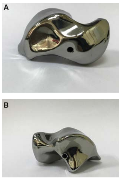
Figure 3. The total talar prosthesis with bilateral holes for the medial and lateral ligament reconstruction, (A) medial view and (B) lateral view.