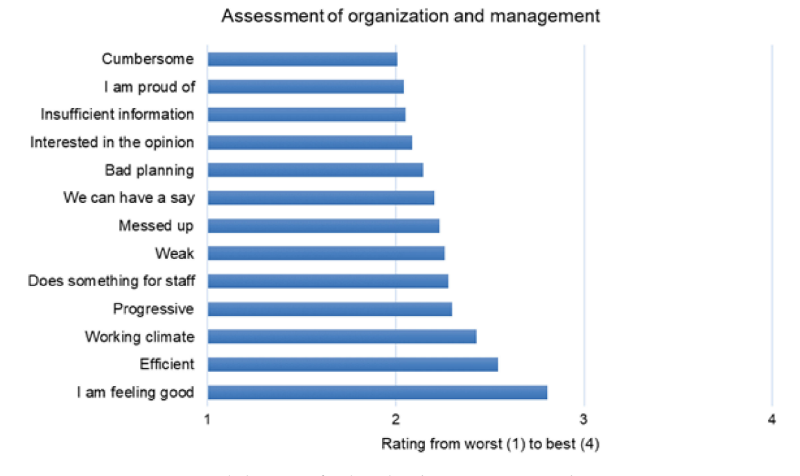
Figure 1. Detailed answers for the subscale "Organization and Management".

For the category "organization and management," the participants indicated that higher management was cumbersome, were uninterested in the opinions of paramedics, and only provided insufficient organizational information, and that employees were not proud of their organization (Figure 1). For the category "payment," the detailed answers showed that most of the paramedics did not think their pay corresponded to their responsibilities, and that pay was not related to performance (Figure 2).