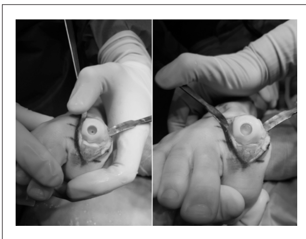
Figure 1. Intraoperative images show the placement of the polyvinyl alcohol hydrogel implant.

Patient PROMIS scores were analyzed using Student t tests. Preoperative and postoperative scores were compared for the full cohort. Subgroup analyses were performed using t tests to evaluate differences in preoperative scores, postoperative scores, or pre- to postoperative change. Statistical significance was evaluated at \alpha = 0.05 .