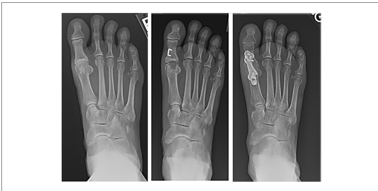
Figure 2. Sixty-three-year-old female undergoing initial polyvinyl alcohol hydrogel implantation in December 2017 with conversion to arthrodesis 14 months postoperatively. Images shown (left to right) are preoperative, 2 weeks following polyvinyl alcohol implantation with Moberg osteotomy, and 1 month following first metatarsophalangeal arthrodesis.

and 49.9) scores compared with the postoperative cohort averages of 52.5 and 43.5, respectively.