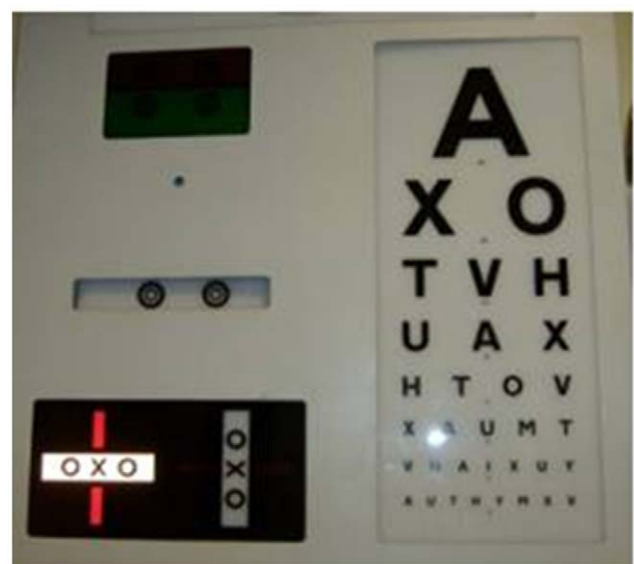
Figure 1. A picture of the distance Mallett Unit (bottom left rectangle).

All five hundred participants completed the study and their age ranged between 18 and 59 years (mean 41.63 years, standard deviation (SD) 11.86 years). All data was recorded with esophoric